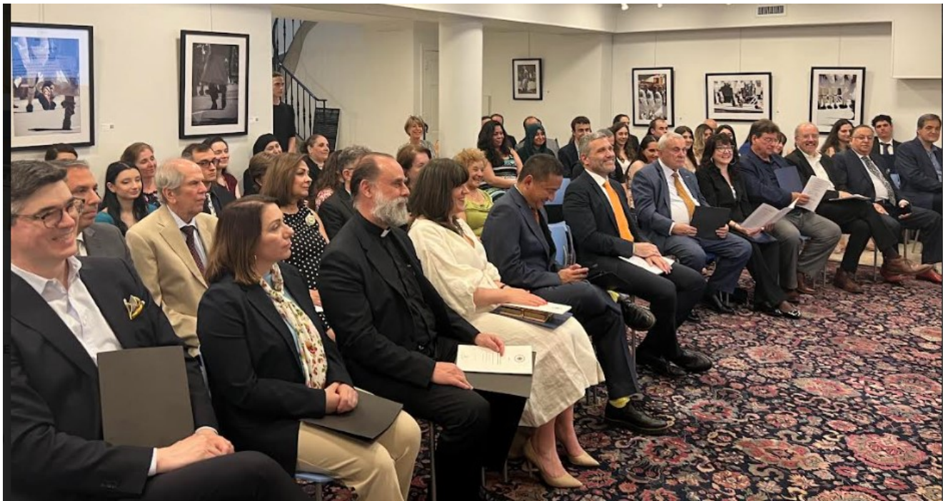
Official guests in the front row and students and faculty while attending the graduation ceremony.