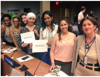
HDFS students at the IDF Observance, UN Headquarters, May 18, 2017