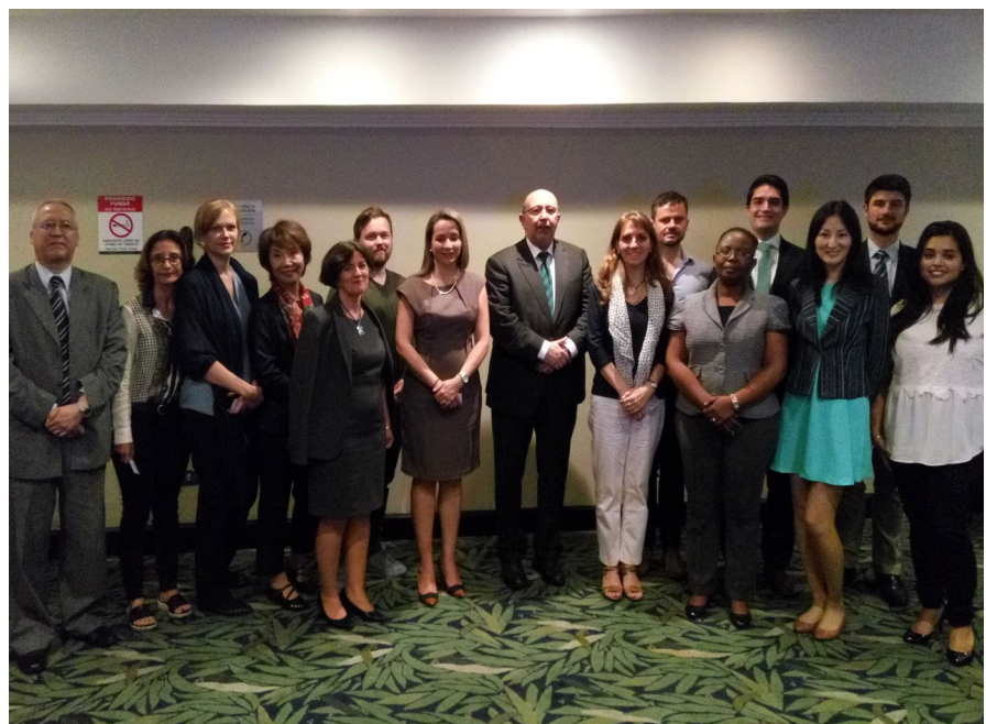
SDG & Family Project Team 2nd Meeting - Regional Expert Group Meeting, San Jose, Costa Rica, May 2017

for Social Development (UNRISD) in Geneva, Switzerland, where she set up collaborations with colleagues